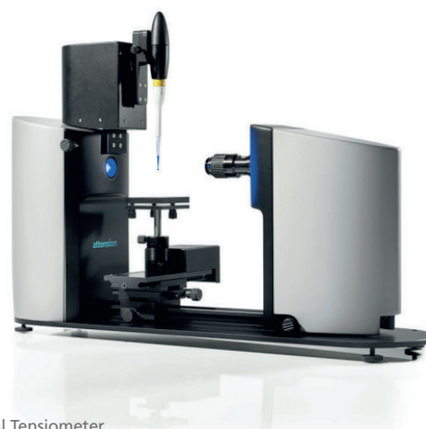
Theta Optical Tensiometer