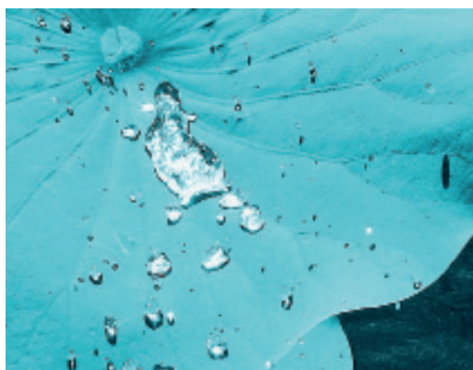
[Figure 1]: The lotus effect is a special case of water repelling, or hydrophobic, behavior

The hydrophilic self-cleaning coatings are based on photocatalysis: when exposed to light, they are able to break down impurities. Self-cleaning windows from this coating material are already commercially available. These kinds of windows act in two ways to clean its surface. The organic dirt absorbed on the window is broken down chemically by photocatalysis and water washes the dirt away by forming sheets due to the low contact angles. Titanium dioxide (TiO 2 ) is a well-known coating for hydrophilic