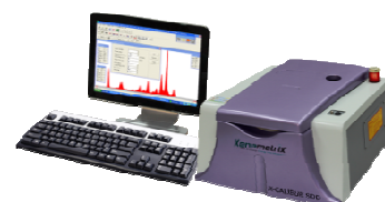
Figure 1: X-Calibur SDD EDXRF analyzer