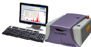
Fig 1: X-Calibur-SDD EDXRF

Sample acquisition was performed with low excitation energies without filters in vacuum; to eliminate absorption of the weak C signal by O 2 and N 2 .